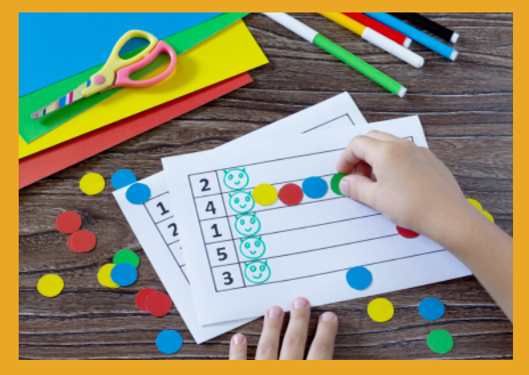
Developing lifelong learners