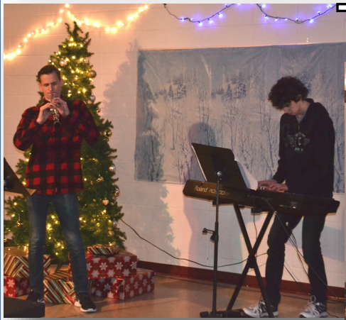
CHRISTMAS COFFEE HOUSE